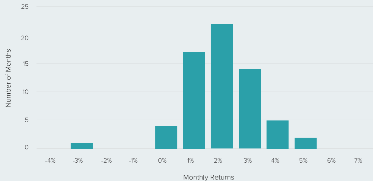
FREQUENCY OF HISTORICAL MONTHLY RETURNS